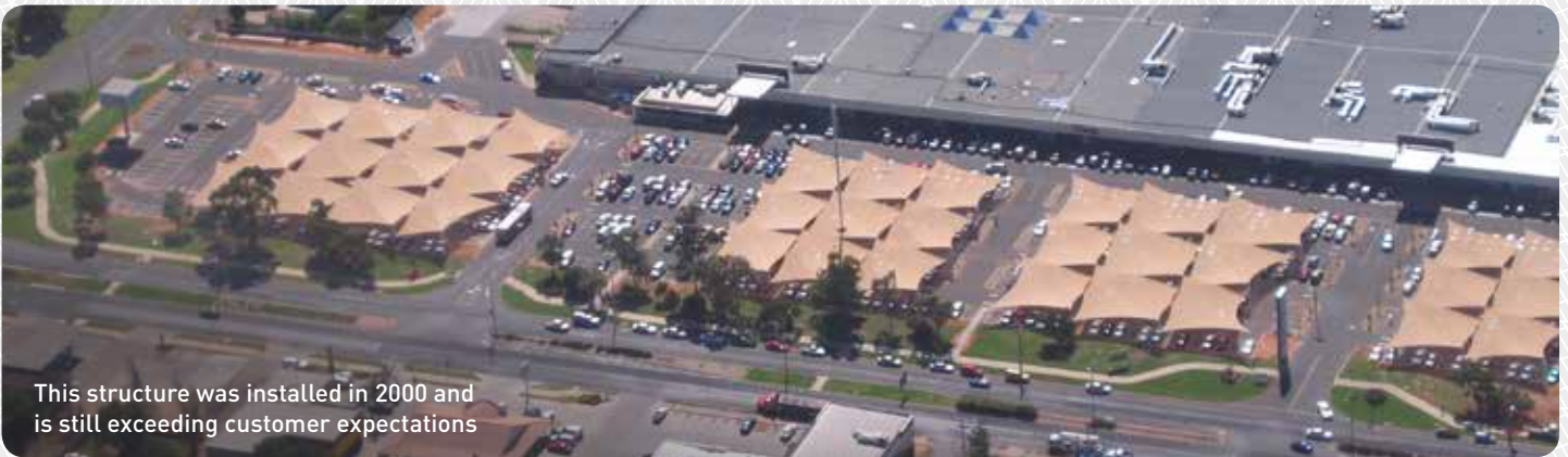
This structure was installed in 2000 and is still exceeding customer expectations